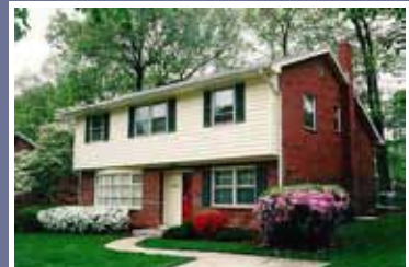
4 BR Split Level 1000 Loxford Ter Sold Price: $300,000