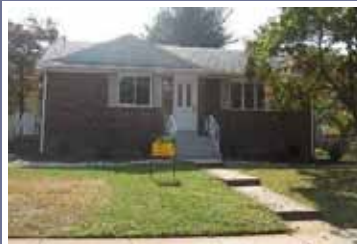
3 BR Rambler 408 Hannes St Sold Price: $320,000