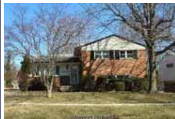
4 BR Split Level 1132 Loxford Ter Sold Price: $289,900