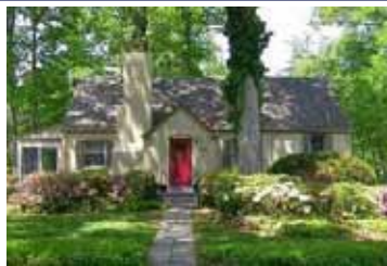
3 BR Cape Cod 111 Northwood Ave Sold Price: $480,000