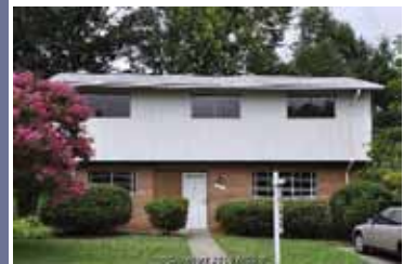
4 BR Split Level 311 Irwin St Sold Price: $285,000