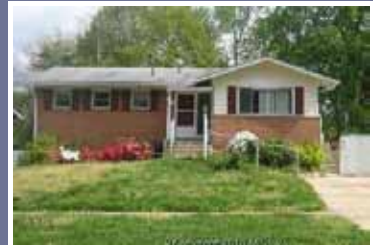
5 BR Rambler 316 Irwin St Sold Price: $424,900