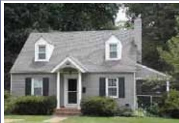
4 BR Cape Cod 308 Marvin Rd Sold Price: $450,000