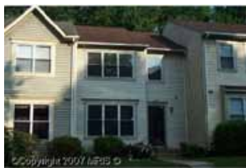
3 BR Townhouse 9 Kinsman View Cir Sold Price: $300,000