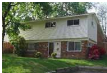
4 BR Split Level 207 Thistle Dr Sold Price: $328,000