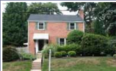
3 BR Colonial 313 Marvin Rd Sold Price: $415,000