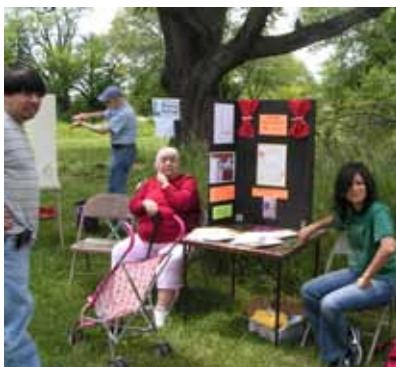
A resident and representative from The Oaks independent living facility for seniors (adjacent to the meadow) had their own exhibit table.