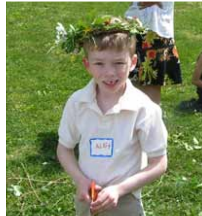
It was a great day for kids, moms, dads, and dogs, too!