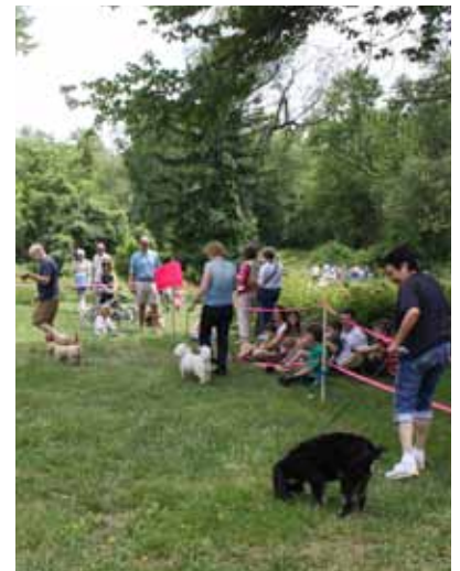
Canines and their humans walked the enclosure to show their pups’ best features.