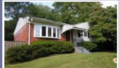
4 BR Rambler 1003 Caddington Ave Sold Price: $327,500