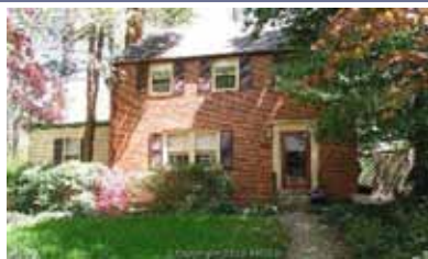
4 BR Colonial 324 Pinewood Ave Sold Price: $475,000