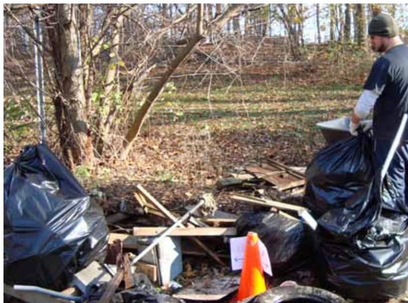
Volunteers like this student removed tons of trash last fall as a first step in preparing the new trail to the Northwest Branch.

[Thanks to Student Trail Stewards for details in this article.] ■