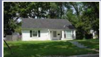
4 BR Cape Cod 311 Ladson Rd Sold Price: $230,000

Above is a sample of Comparable Recent Sales from the MRIS as of May 11, 2010