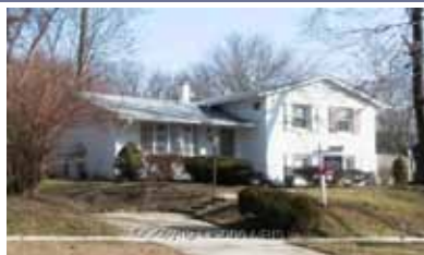
4 BR Split Level 803 Malta Ln Sold Price: $295,000