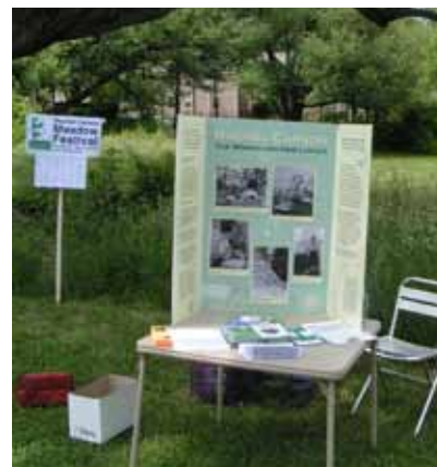
One display told all about the woman for whom the meadow was named.