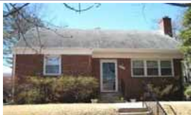
4 BR Cape Cod 10620 Eastwood Ave Sold Price: $379,000