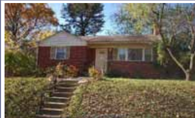
3 BR Rambler 10614 Eastwood Ave Sold Price: $359,900