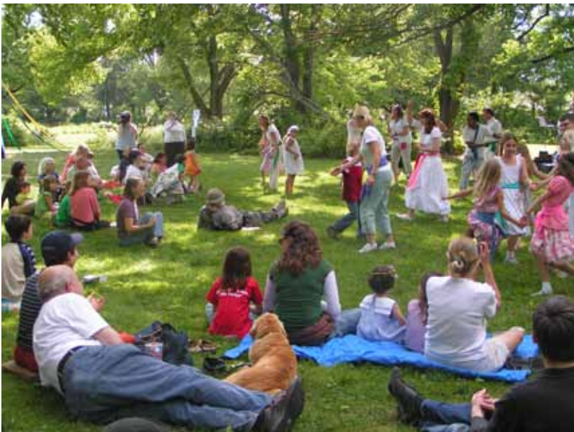
The Washington Revels delighted the crowd with songs, music, dancing, and skits rejoicing in the coming of spring.