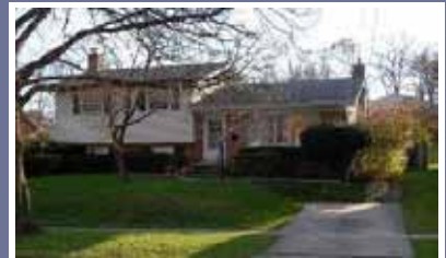
4 BR Split Level 910 Loxford Ter Sold Price: $398,000