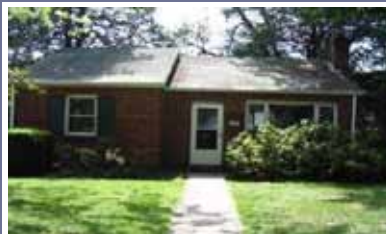
2 BR Rambler 310 Ladson Rd Sold Price: $250,500