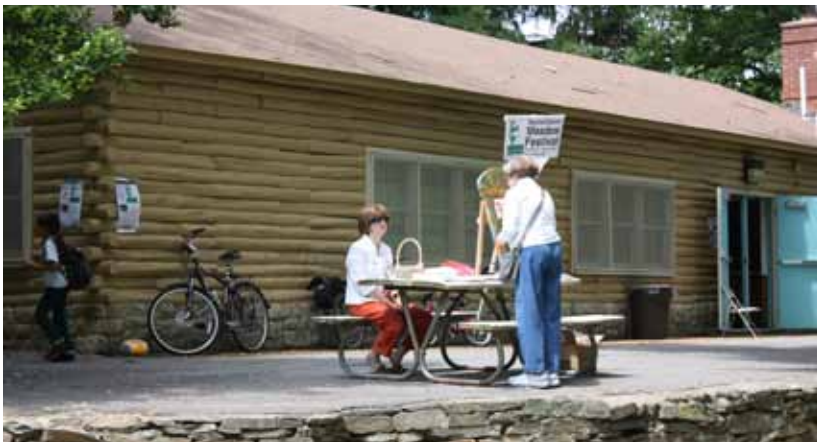
We were allowed to use the Rec Center one last time, during the Rachel Carson Meadow Festival held 16 May (see p. 12).