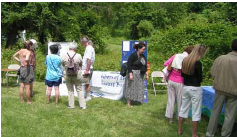
Attendees gathered around the many environmental exhibits.