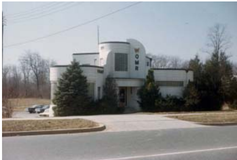
The WQMR radio transmitter on Arcola Avenue in Kemp Mill.

"Remains of the Kensington Mica Mine can be found in what is now the 'Springbrook Forest' subdivision (Wheaton, Maryland) and the adjoining